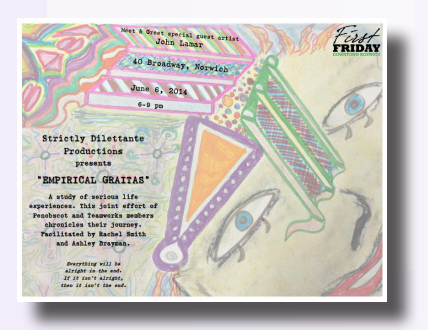
Strictly Dilettante Productions